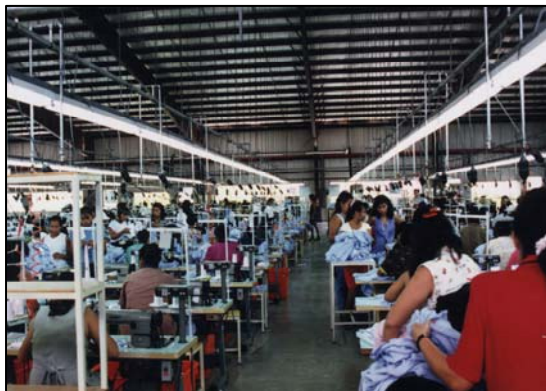
At left: Sitting in long production lines, women and men work at their sewing machines in an apparel maquila.