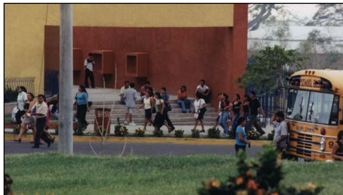
At right: Men and women leave the maquila at the end of the work day to board the buses that will take them home.